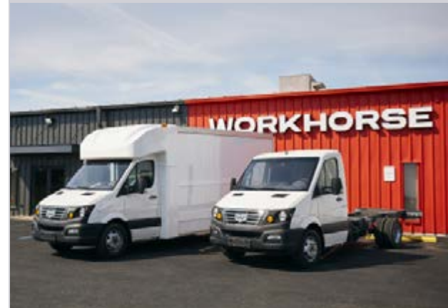
W750 Step Van and W4 CC Cab Chassis Class 4 Medium-Duty