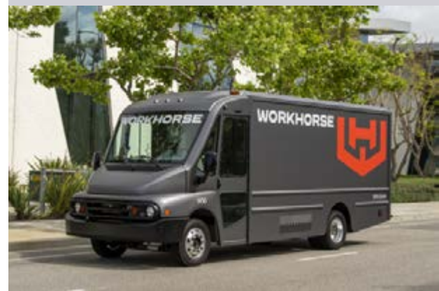
W56 Step Van Class 5/6 Medium-Duty