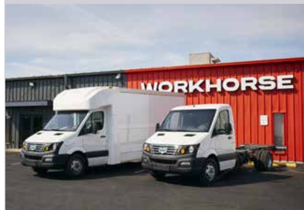
W750 Step Van and W4 CC Cab Chassis Class 4 Medium-Duty