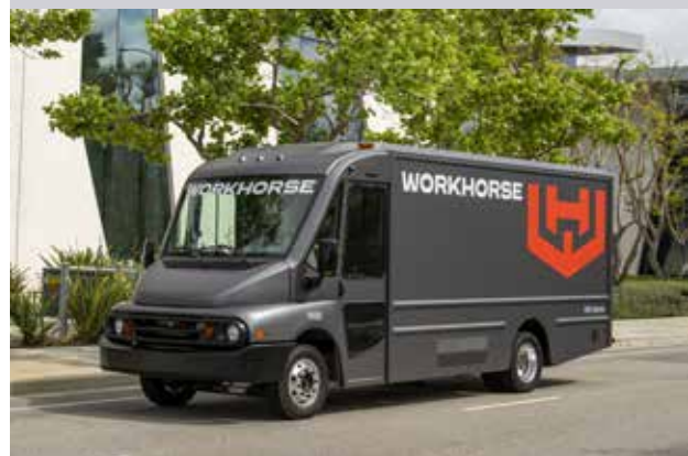
W56 Step Van Class 5/6 Medium-Duty